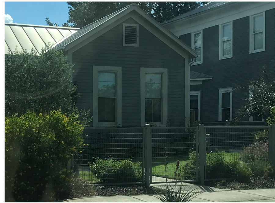
EXISTING FENCE PRECEDENTS IN NEIGHBORHOOD OF SIMILAR STYLE